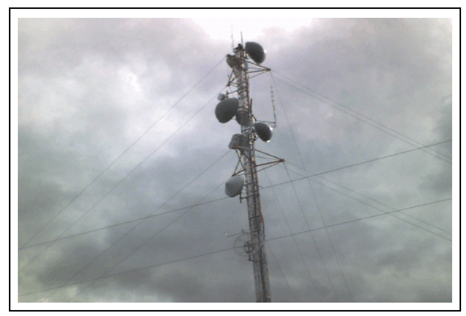
A Look at the Tower Holding the Mich-A-Con Repeater Antennas

I monitored the 146.850 repeater on the way home and heard several Hams on the air reporting how much better the repeater sounds now.... Great Job Guys!